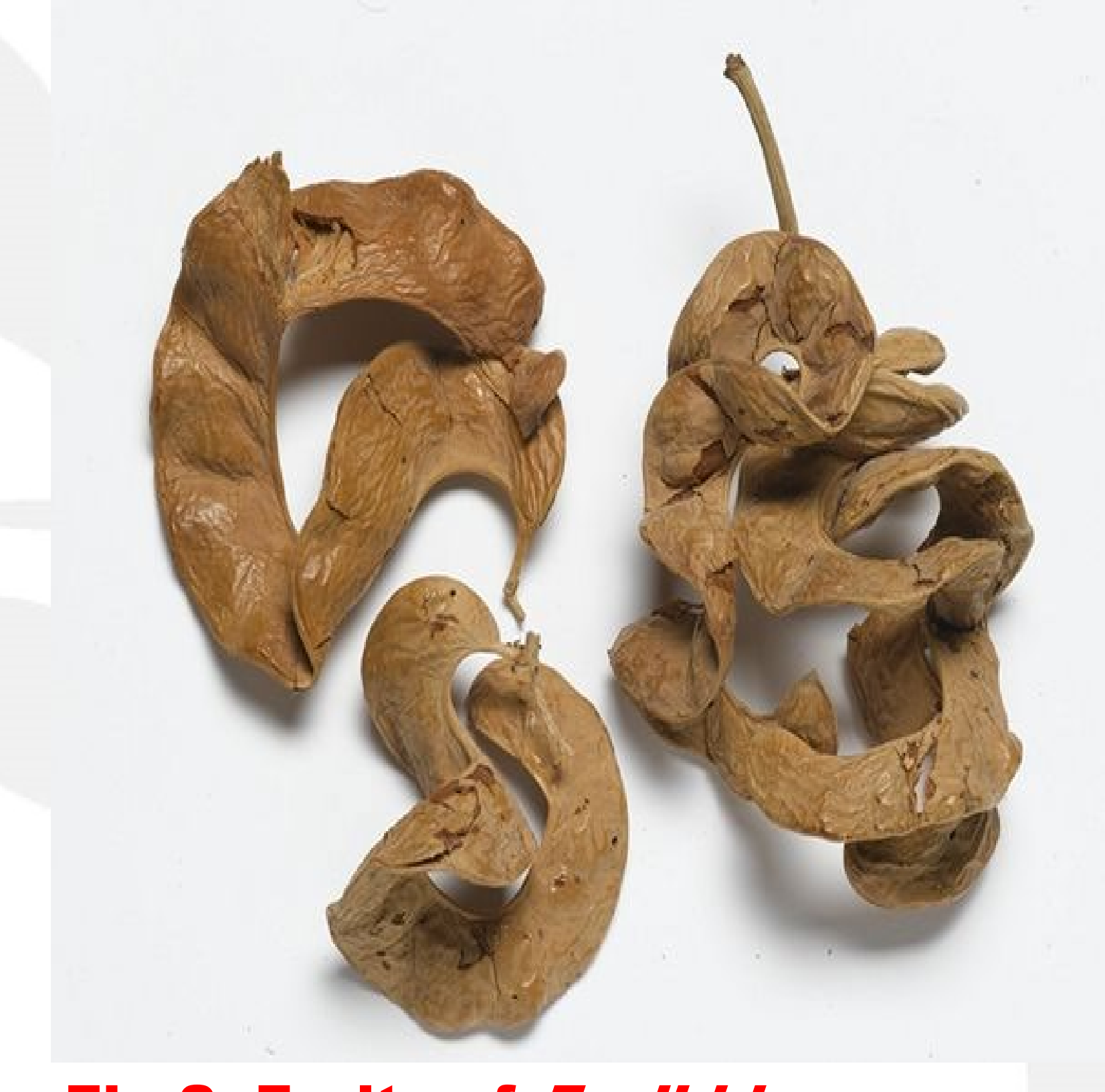
Fig 2: Fruits of F. albida