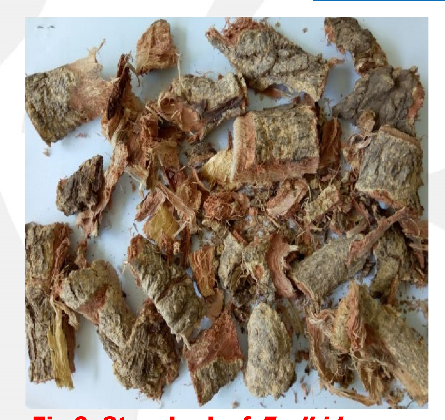
Fig 3: Stem bark of F. albida