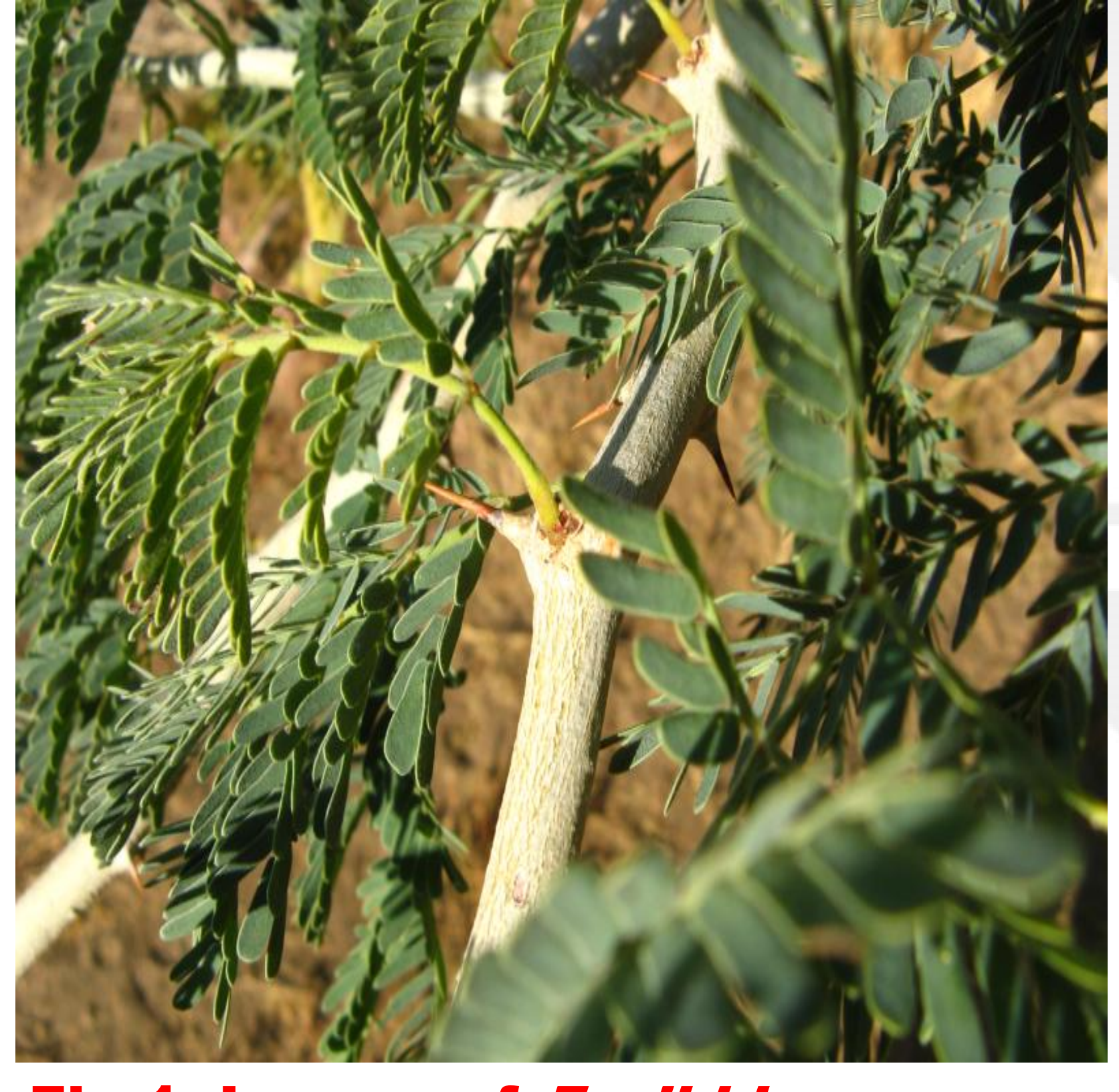
Fig 1: Leaves of F. albida